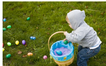
Easter Egg Hunt Easter Sunday 11:15 am

Palm Sunday 8 am & 10 am Maundy Thursday 6:30 pm Good Friday 12 noon Holy Saturday 7 pm Easter Sunday 8 am & 10 am